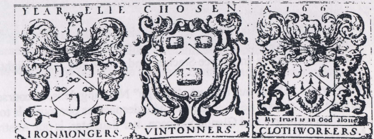
The Coats of Arms of the Twelve Great Companies in 1667. The School still uses these arms today.